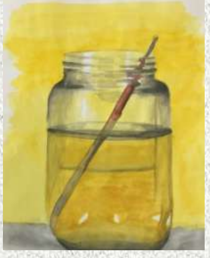
Painting by Amoli shah (Class X)